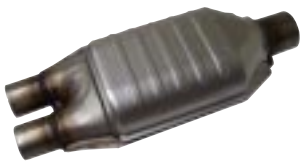
Dual inlet, Single outlet, w/o air tube