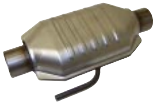
Single inlet, single outlet, with air tube