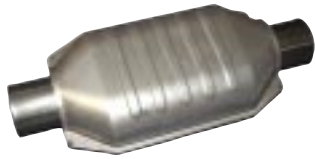
Single inlet, single outlet, w/o air tube

NOTE: It is illegal to install a catalytic converter that is not approved for the specific vehicle application. It is also illegal to select a catalytic converter for installation based solely on vehicle weight and engine size or based upon catalytic converter physical shape, size, configuration, or pipe diameters. Further, PC1, PC2, T1, and T2 converters must never be installed on OBDII vehicles.