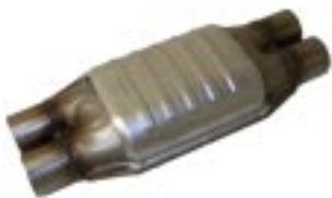
Dual inlet, Dual outlet, w/o air tube